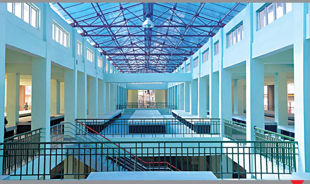
Shopping Complex Block 'A & B' - Thoubal , Manipur