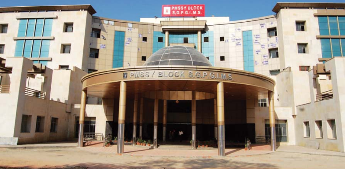
Sanjay Gandhi Post Graduate Institute of Medical Sciences- Lucknow