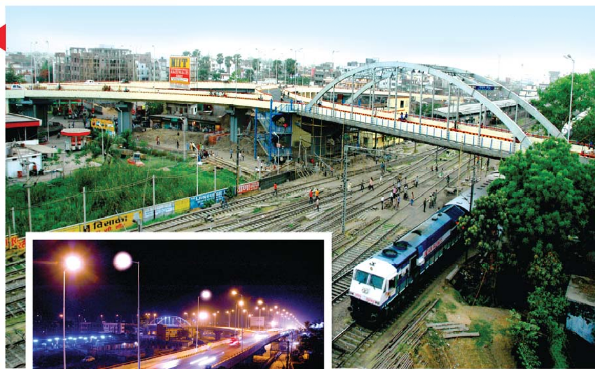
Road Over Bridge - Rajendra Nagar, Patna